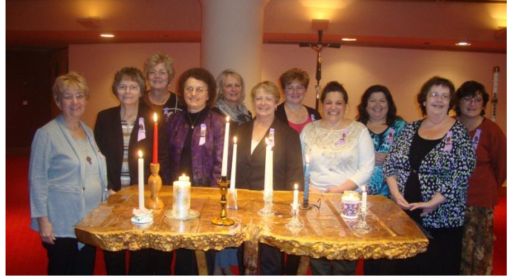
Newly commissioned faith community nurses join ranks of 14,000 worldwide.